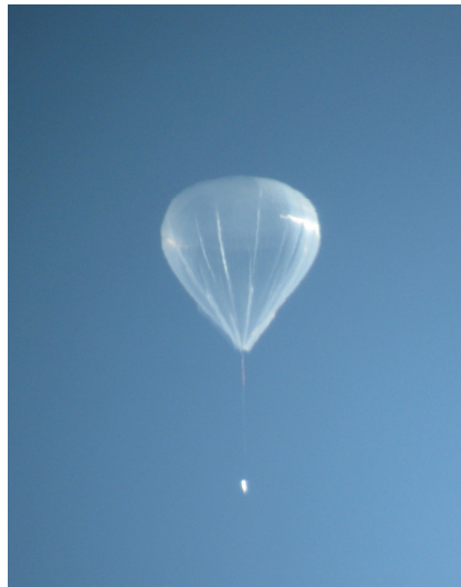
Figure 2. Research Balloon at High Altitude

Consider the large research balloon shown in Figure 2 photographed by T. Dunham of the Lowell Observatory through a telescope. This balloon was launched from Fort Sumner, New Mexico on June 11, 2009. It reached an altitude of between 110,000 and 120,000 feet and had an estimated diameter of six hundred feet. It was seen by many people on the ground in Arizona the same evening of the launch. (Lowell, 2009) The heavy payload distorted its shape from what otherwise would have been nearly a sphere. 12 Both the payload and the teardrop shape become the two primary critical details. Other critical details here include the barely visible payload package's suspension cable and the vertical lines that form part of the stress-support harness.