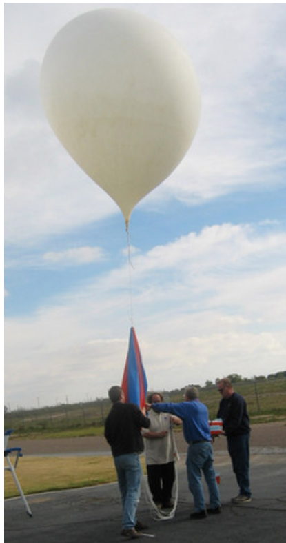
Figure 1. Photograph of Weather Balloon Viewed from the Side Prior to Launch

Considering the names "sphere" "balloon," and "globe" it can be pointed out that all are three-dimensional objects but a balloon and globe may or may not be spherical as is shown in Figure 1 and 4.1 and 4.2. As discussed elsewhere, many balloons are distorted in shape due to payload packages suspended beneath them and/or by the impact of wind. So a more precise set of shape-names is needed in the study of UAP in order to reduce the confusion and lack of precision that accompanies the use of so many different shape-names.