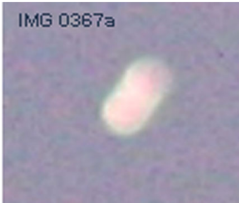
Figure 15 Image 0367 - Exposure Stretched